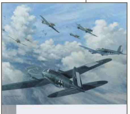
BATTLE OF BRITAIN 1940 The Luftwaffe's 'Eagle Attack' DOUGLAS C. DILDY | ILLUSTRATED BY GRAHAM TURNER

Special Contest. Models from the original "Adver-"Part Deux."